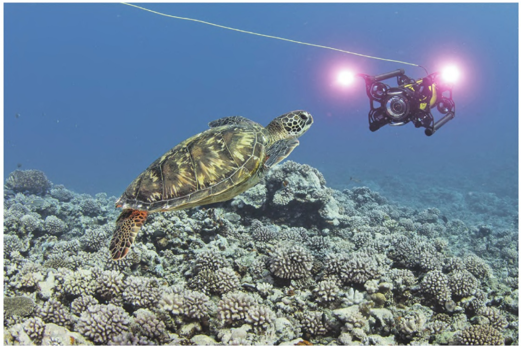
The Boxfish ROV in Tahiti.