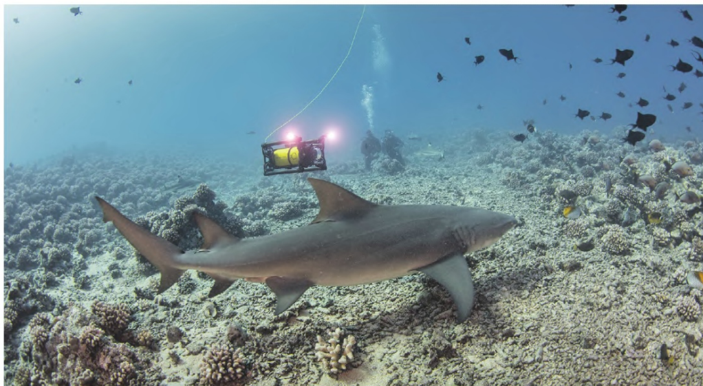
The Boxfish ROV captures another incredible underwater scene in Tahiti.

The range of applications for Boxfish technology is vast, and it’s being used by different organisations to sample gas from underwater volcanoes, collect coral samples and to measure gas exchange in sponges.