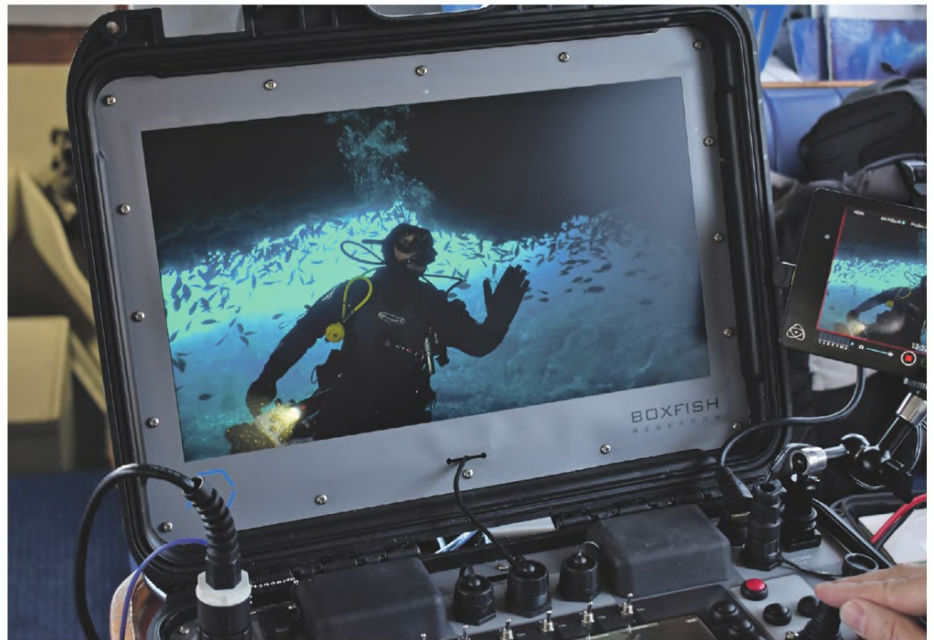
The Boxfish ROV control station at the Poor Knights Islands in Northland.