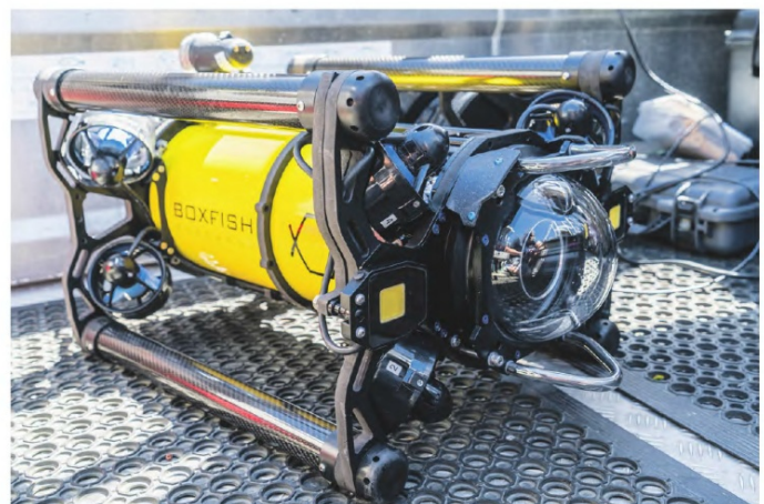
Kiwi ingenuity at its finest - the Boxfish ROV.

Artworks Courtyard 10am to 2pm Local artisan wares, clothing, street food, face painting and circus entertainment contact oneroasundaymarket@gmail.com