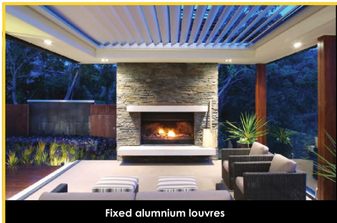
Fixed aluminium louvres