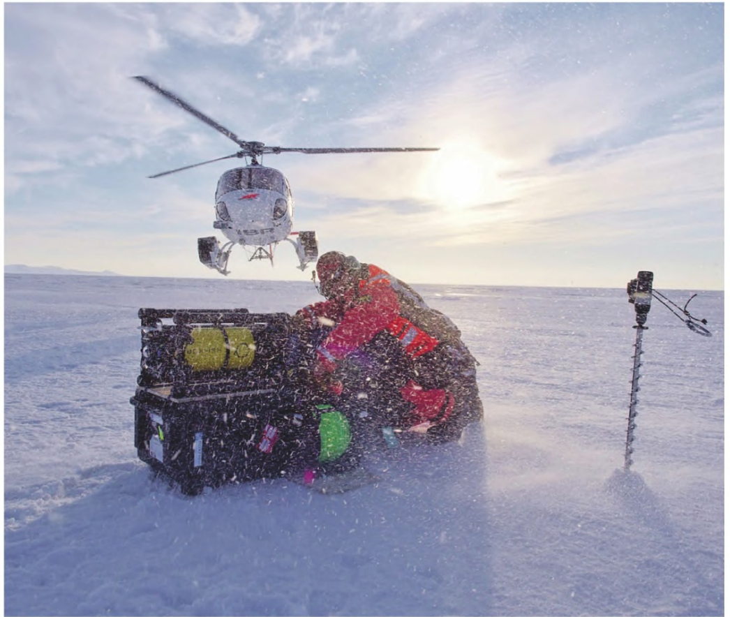
The Boxfish ROV was deployed on the Antarctic ice by helicopter as part of a research expedition this January.

"This has been our focus; we designed it specifically for good video capture. Our active stabilisation system, which is propri-