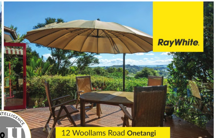
12 Woollams Road Onetangi