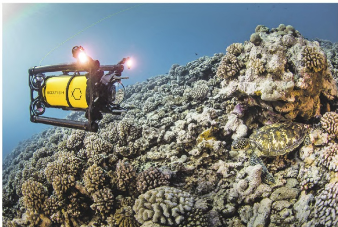
Boxfish technology is being used around the world to gain information about marine life.

“I have colleagues in Germany who work for a large research institute and who have euros coming out of their ears. They have a very expensive ROV, but you have to have a