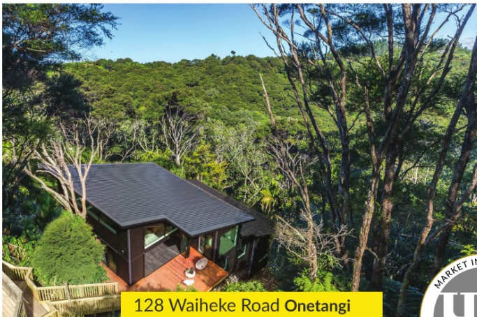
128 Waiheke Road Onetangi

“I worked for so many years with medical professionals, and I had this dream of applying the same sort of technical innovation to field science or something in the outdoors.