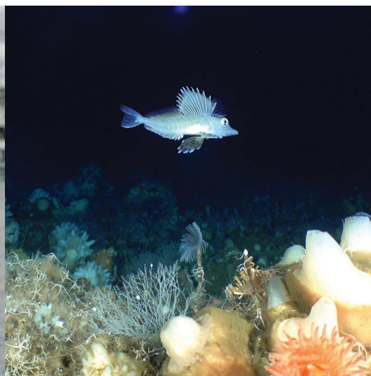
Screengrab from footage collected November 2019 by NIWA (Antarctica NZ Event K750-F), using their Boxfish ROV.